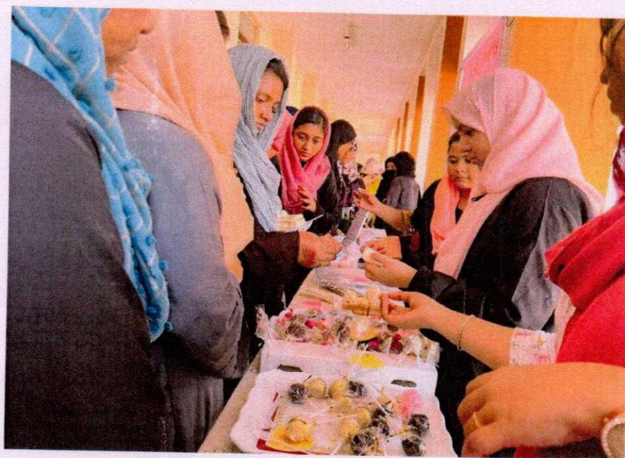
Products are exhibited and sales made Students are visited the stall arranged by Alumnae Entrepreneurs from various batches