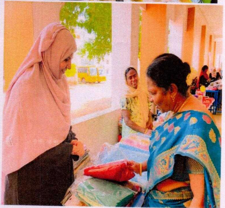
Products are exhibited and sales made Students are visited the stall arranged by Alumnae Entrepreneurs from various batches