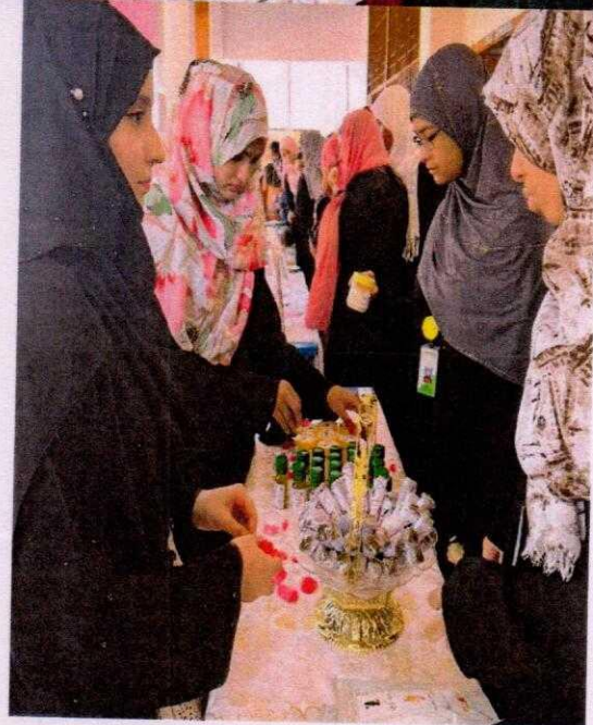
Faculties from various departments visited the stalls